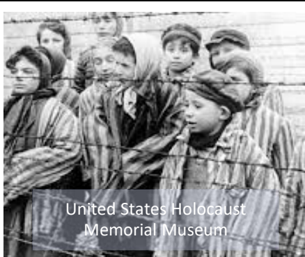
United States Holocaust Memorial Museum