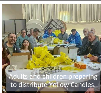
Adults and children preparing to distribute Yellow Candles.