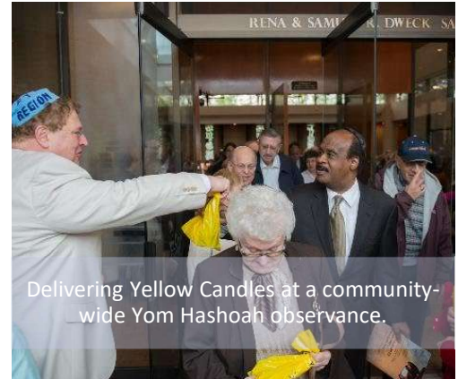
Delivering Yellow Candles at a community-wide Yom Hashoah observance.

FYI: Some candles cannot be delivered because of gated communities and security buildings. Ask your volunteers to bring those back. In turn, mail those Yellow Candles that could not be hand-delivered or make other arrangements with the recipient.